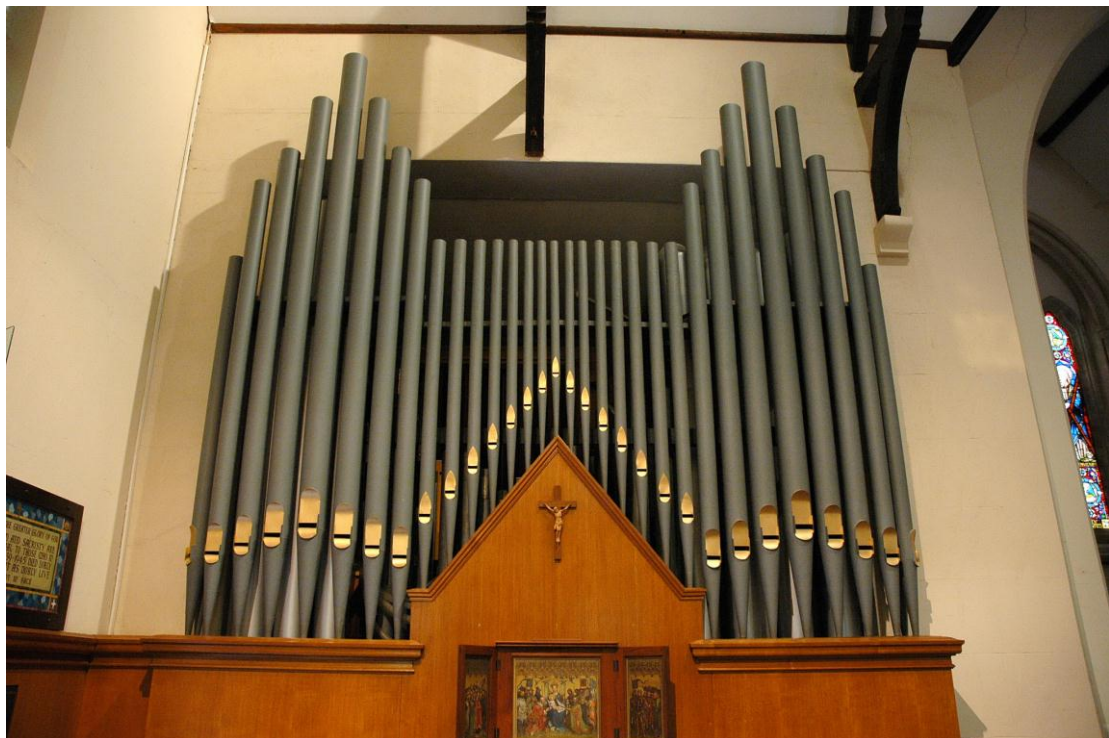
Pipes and Organ Chamber 28 September 2008

In 2006 a Restoration and Conservation Fund for St Andrew's Church was established in partnership with the National Trust. Stage 1 of this appeal was to raise $210,000 to restore and rebuild the organ. In October 2007 this target was reached and exceeded. The final cost of the rebuild was $217,252. The Church provided $63,147 from its own funds and the rest was received through public donations and grants.