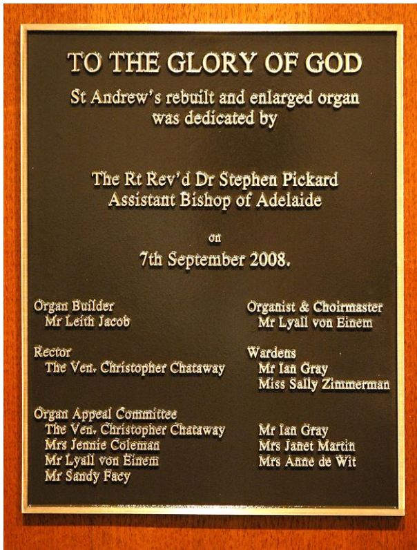
Plaque on the Organ Console