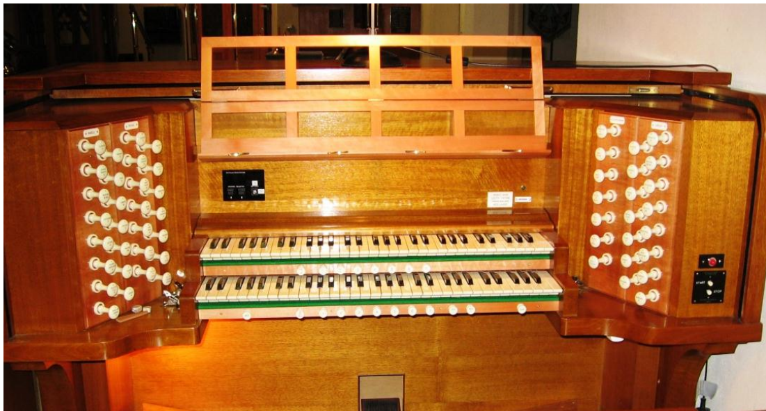
Organ Console 28 September 2008

In 2006 a Restoration and Conservation Fund for St Andrew's Church was established in partnership with the National Trust. Stage 1 of this appeal was to raise $210,000 to restore and rebuild the organ. In October 2007 this target was reached and exceeded. The final cost of the rebuild was $217,252. The Church provided $63,147 from its own funds and the rest was received through public donations and grants.